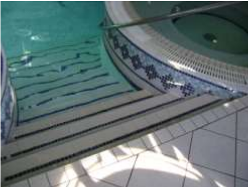
There are 12 steps down into the pool with handrails to both sides. The pool is level with the deck.