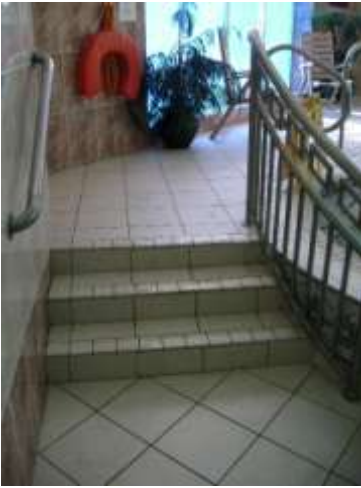
There are 3 x steps (with handrails to both sides) up to the spa bath also leading to the steps into the swimming pool.