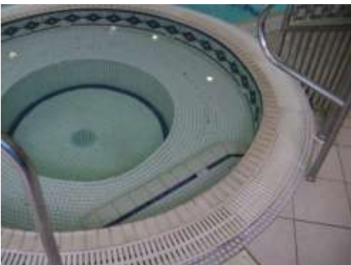
There are 3 x steps down into the spa bath with a handrail.