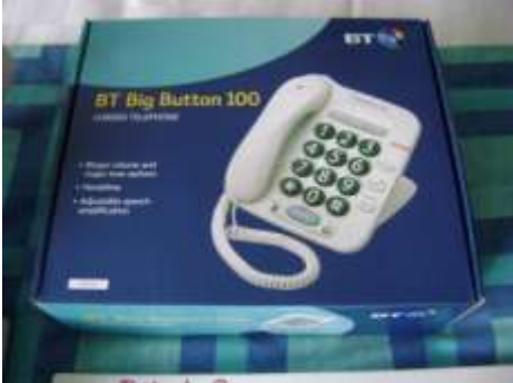
Big Button telephones.